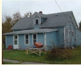
Before Creighton OOR