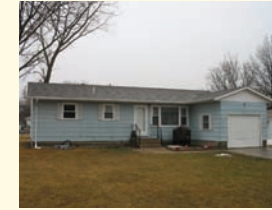
Before Fullerton OOR