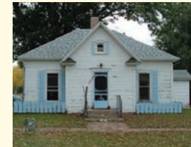
Before Oakdale OOR