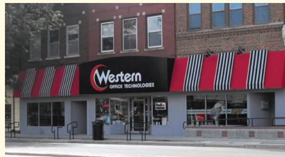
Facade Improvements - Norfolk