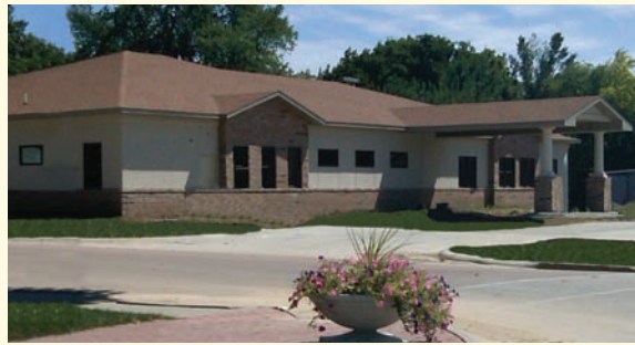
Decatur Senior Center

NENEDD is supported by a combination of funds. A planning grant from the US Economic Development Administration (EDA) provides $51,000 each year which is matched by local membership dues. NENEDD derives most of its funding from local membership dues and special contracts.