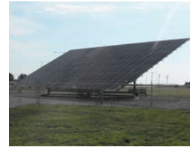
Behlen Mfg., Columbus